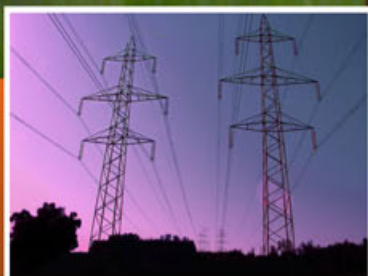
Electrical • Utilities