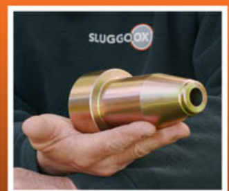
Fits In Your Toolbox